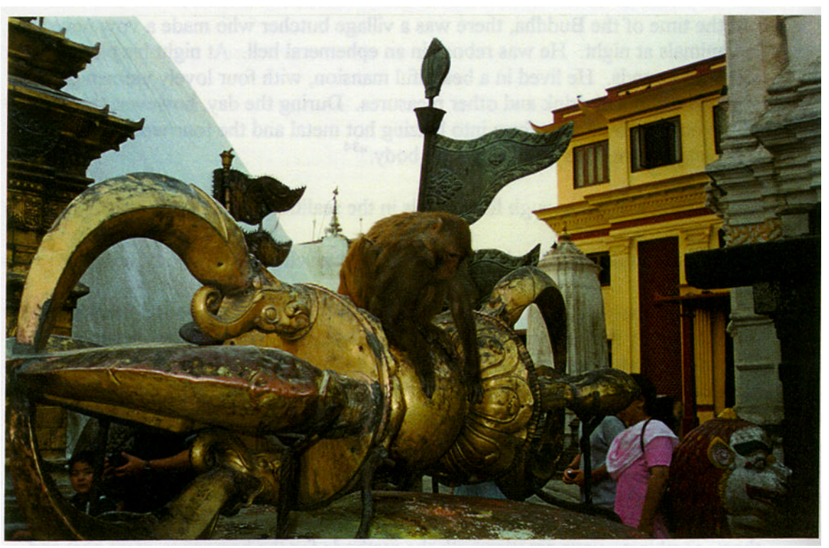
A monkey meditating on a dorje, Swayambu Buddhist Stupa