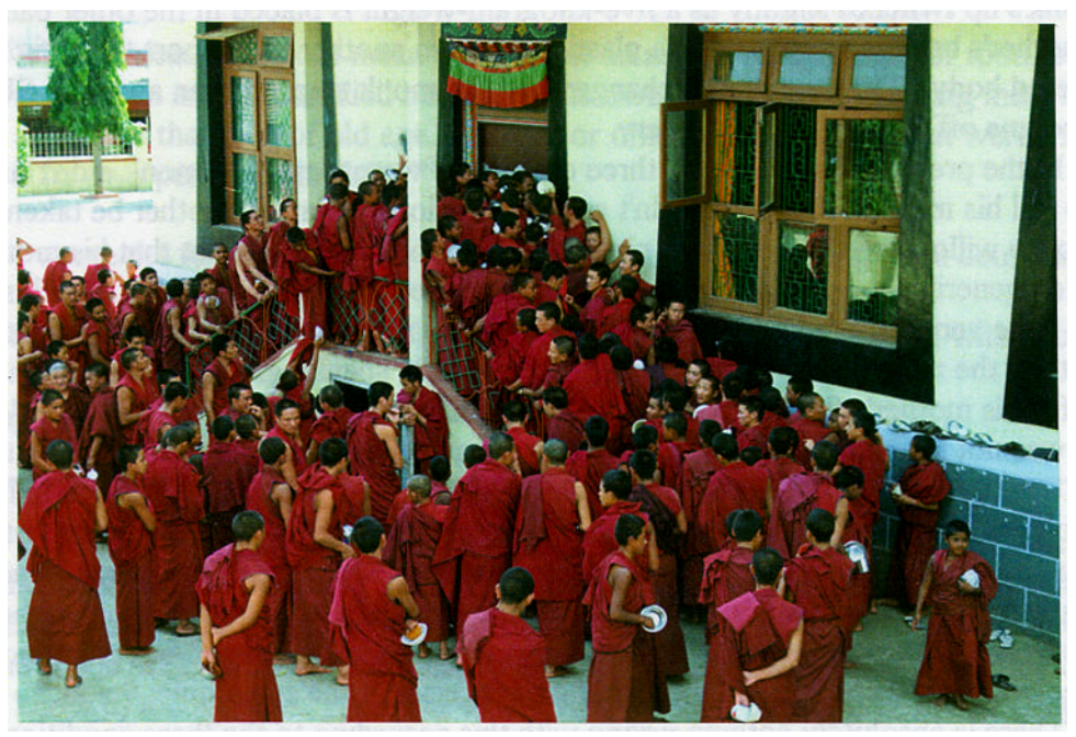
Monks at Sera Mey scramble to get into the cafeteria, where meat is regularly served.

They both laugh as another fleet of monks approaches.