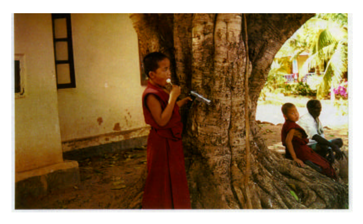
A monk sucks on his lolly pop, looking for someone to shoot with his pellet gun.