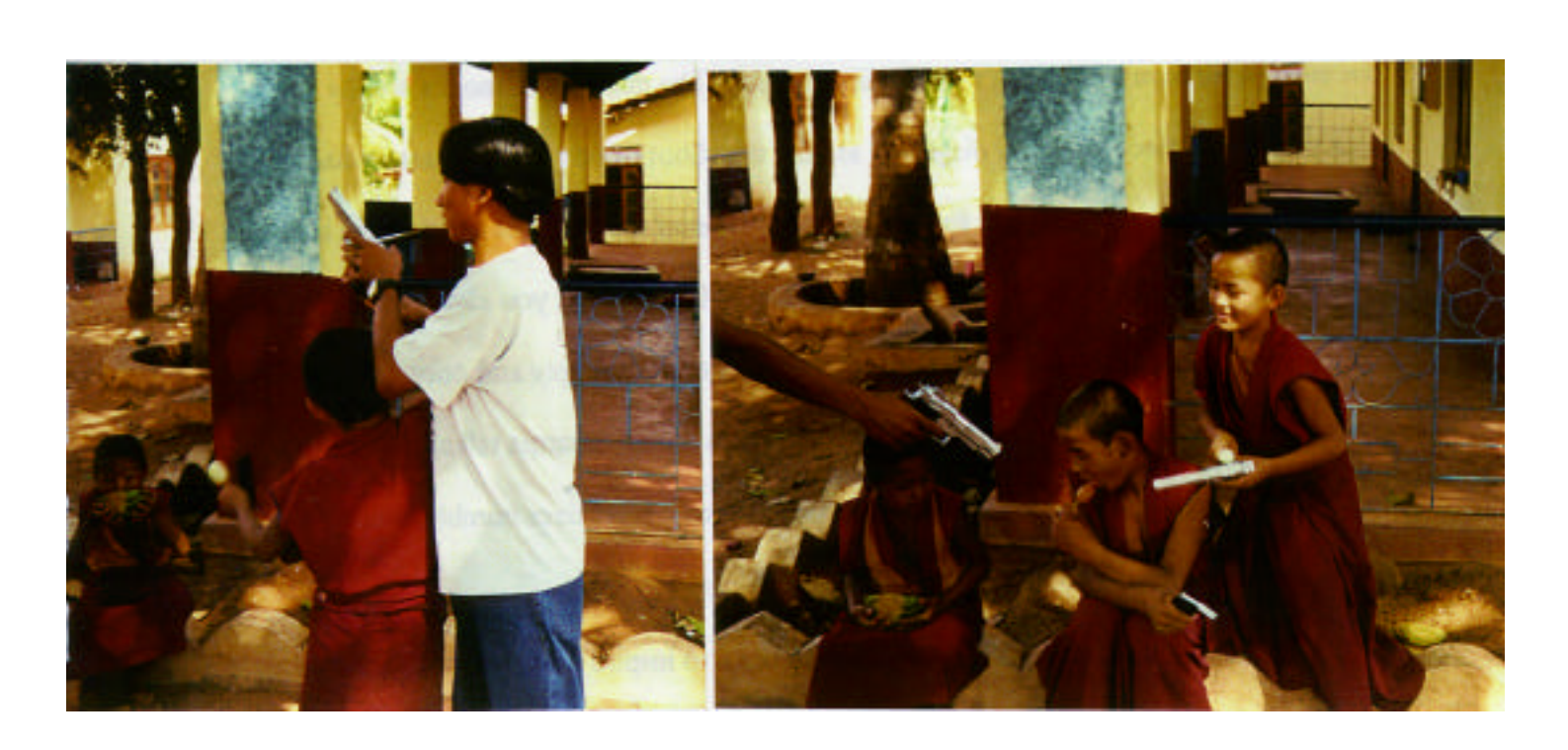
A monk struggles to take a plastic gun from Dorje's son as monks in the next frame casually shoot at each other.